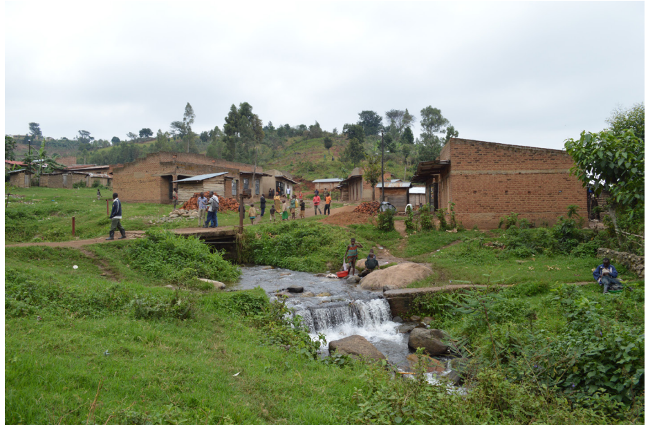
Kibwa village (near Igassa ORIO Project Site in Kabarole district) - one of the Project areas that will benefit from power generated under the ORIO Project.

The project area covers seven (7) districts, namely: Hoima, Kabarole, Bundibugyo, Bunyangabu, Kasese, Mitooma and Bushenyi.