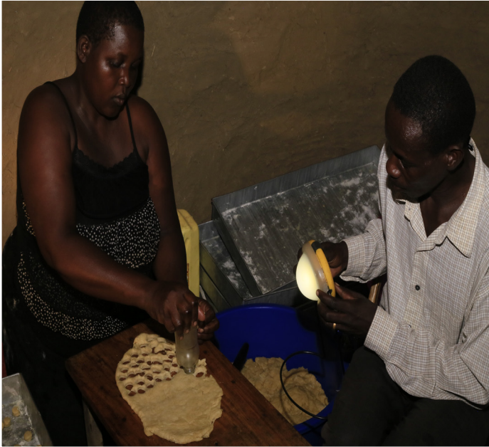
A household in Amuria district using a solar system acquired through the Solar Loan Programme