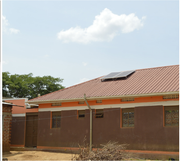
A clinic in Bukedea district using a solar system acquired through the Solar Loan Programme