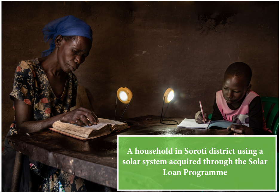
A household in Soroti district using a solar system acquired through the Solar Loan Programme

• EBO SACCO Limited • Nile Microfinance Limited to extend Solar Loans to households and commercial enterprises at the grassroots.